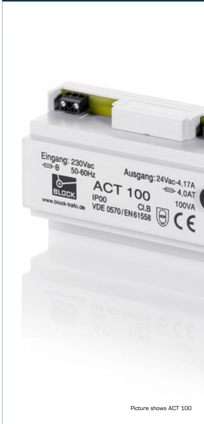
Picture shows ACT 100