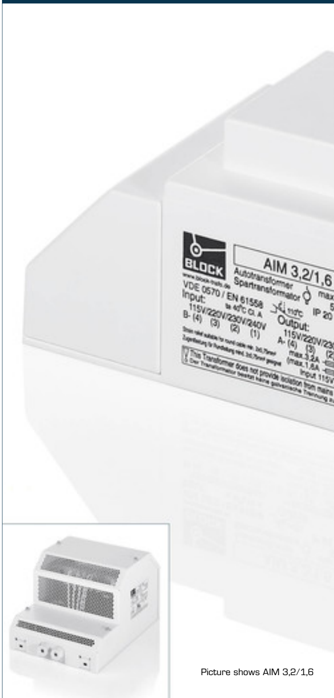
Picture shows AIM 3,2/1,6