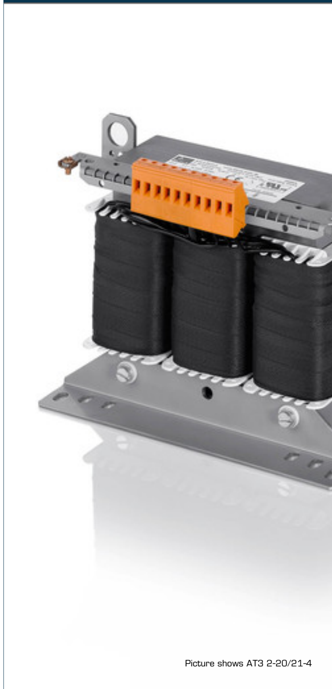
Picture shows AT3 2-20/21-4