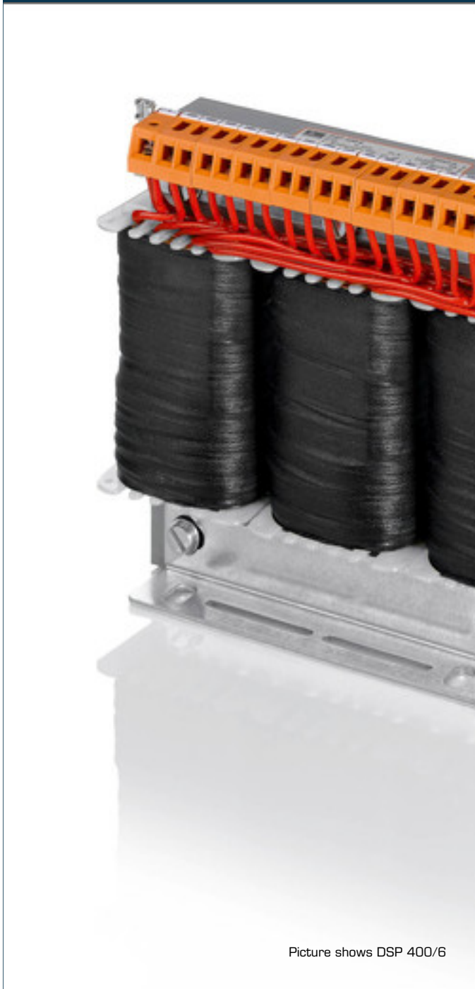
Picture shows DSP 400/6