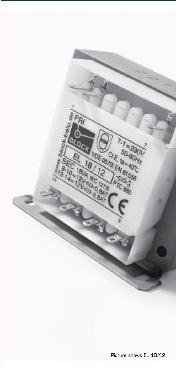
Picture shows EL 18/12