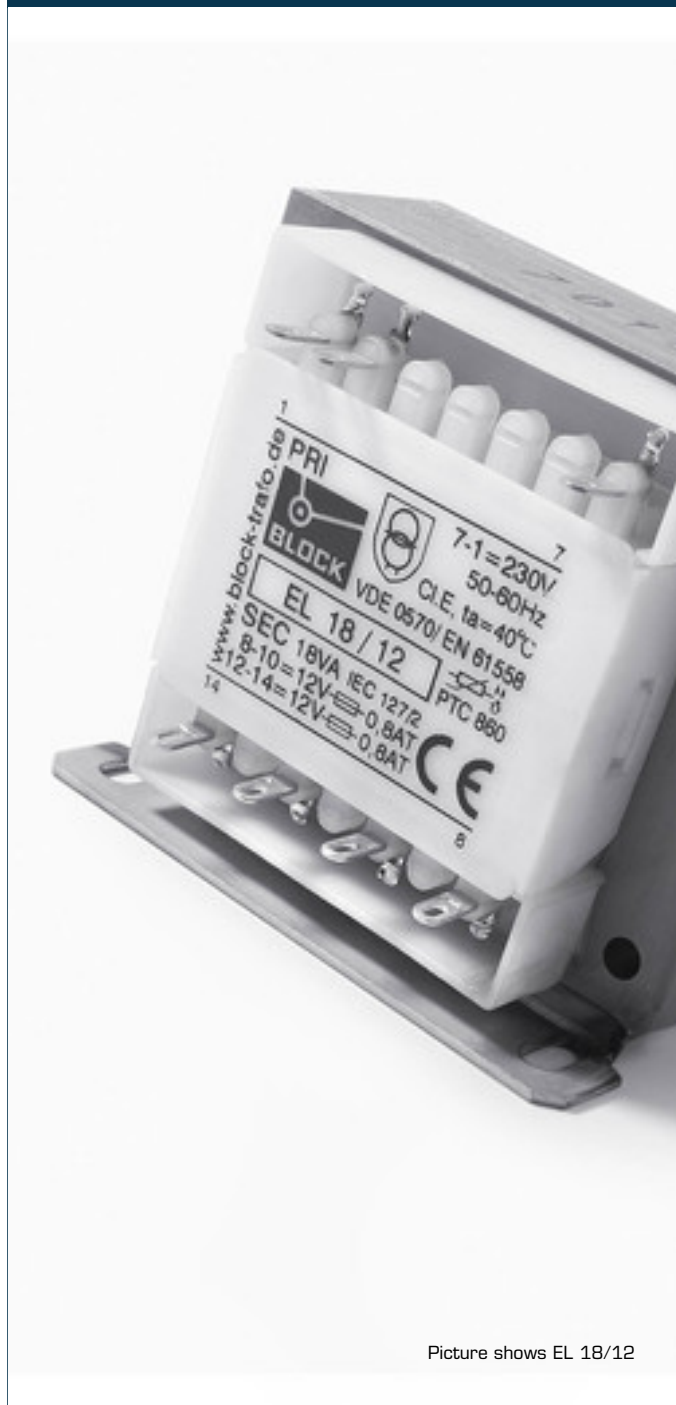
Picture shows EL 18/12