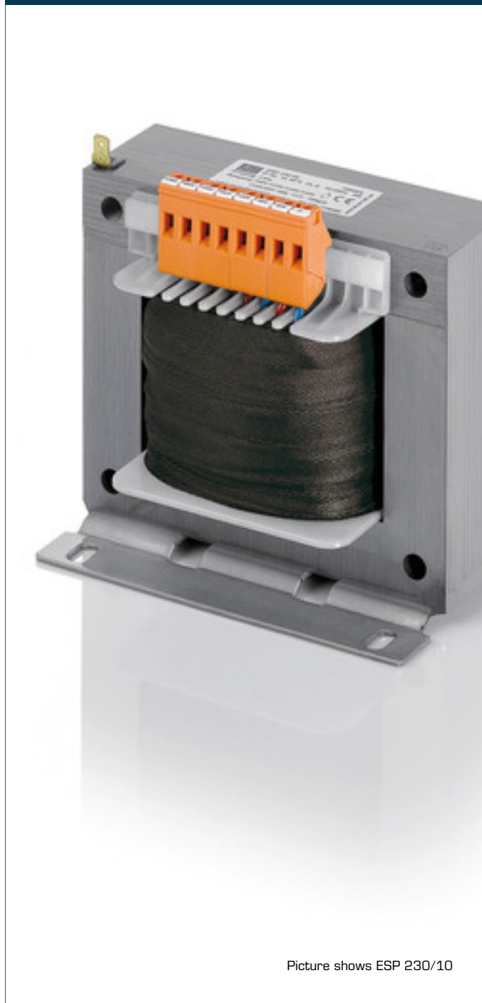
Picture shows ESP 230/10