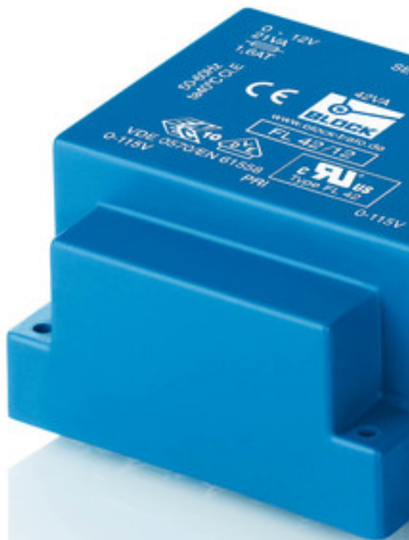
Picture shows FL 42/12