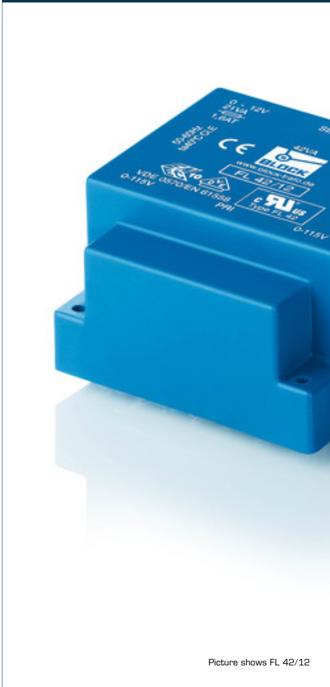
Picture shows FL 42/12