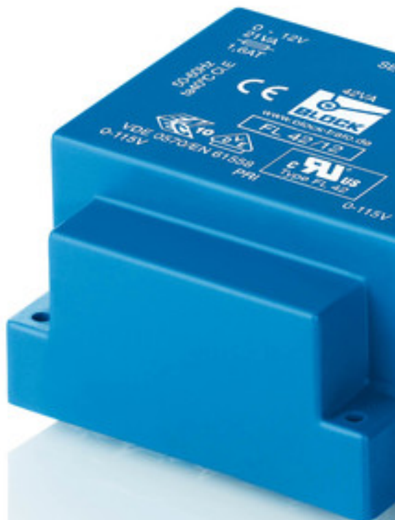
Picture shows FL 42/12