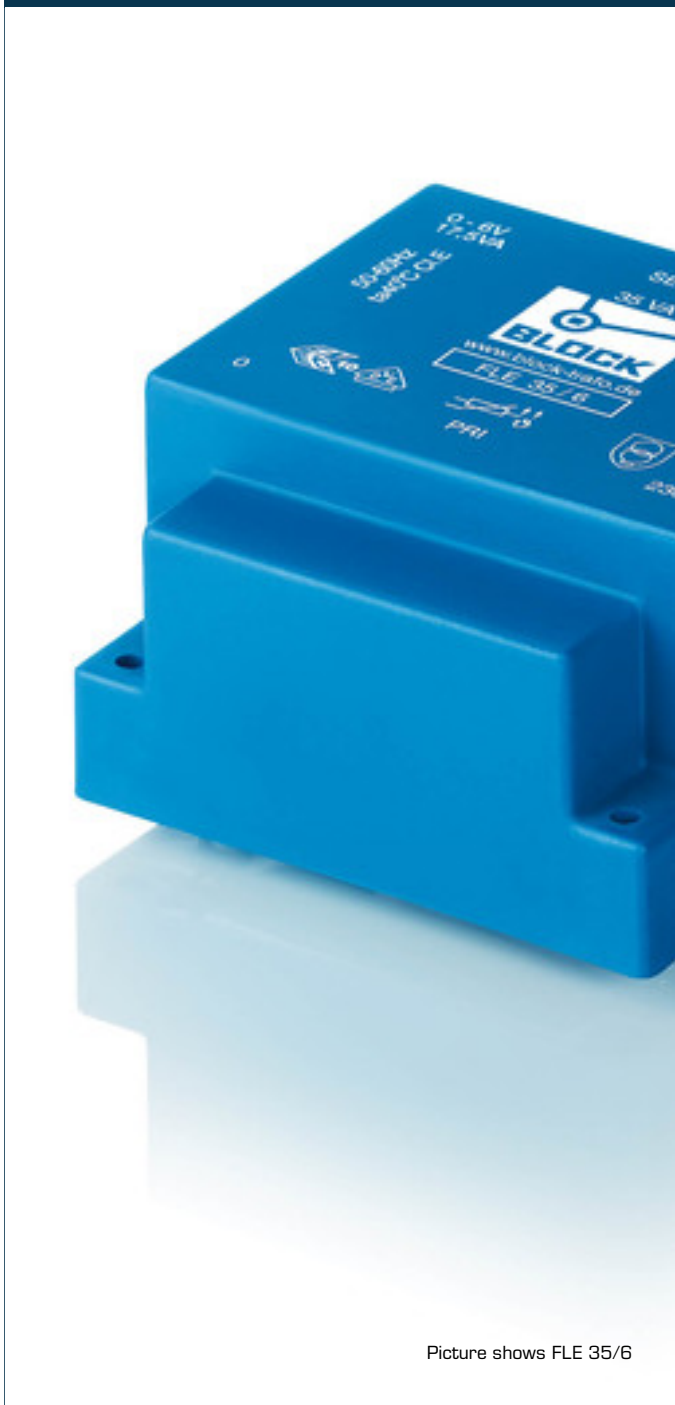
Picture shows FLE 35/6