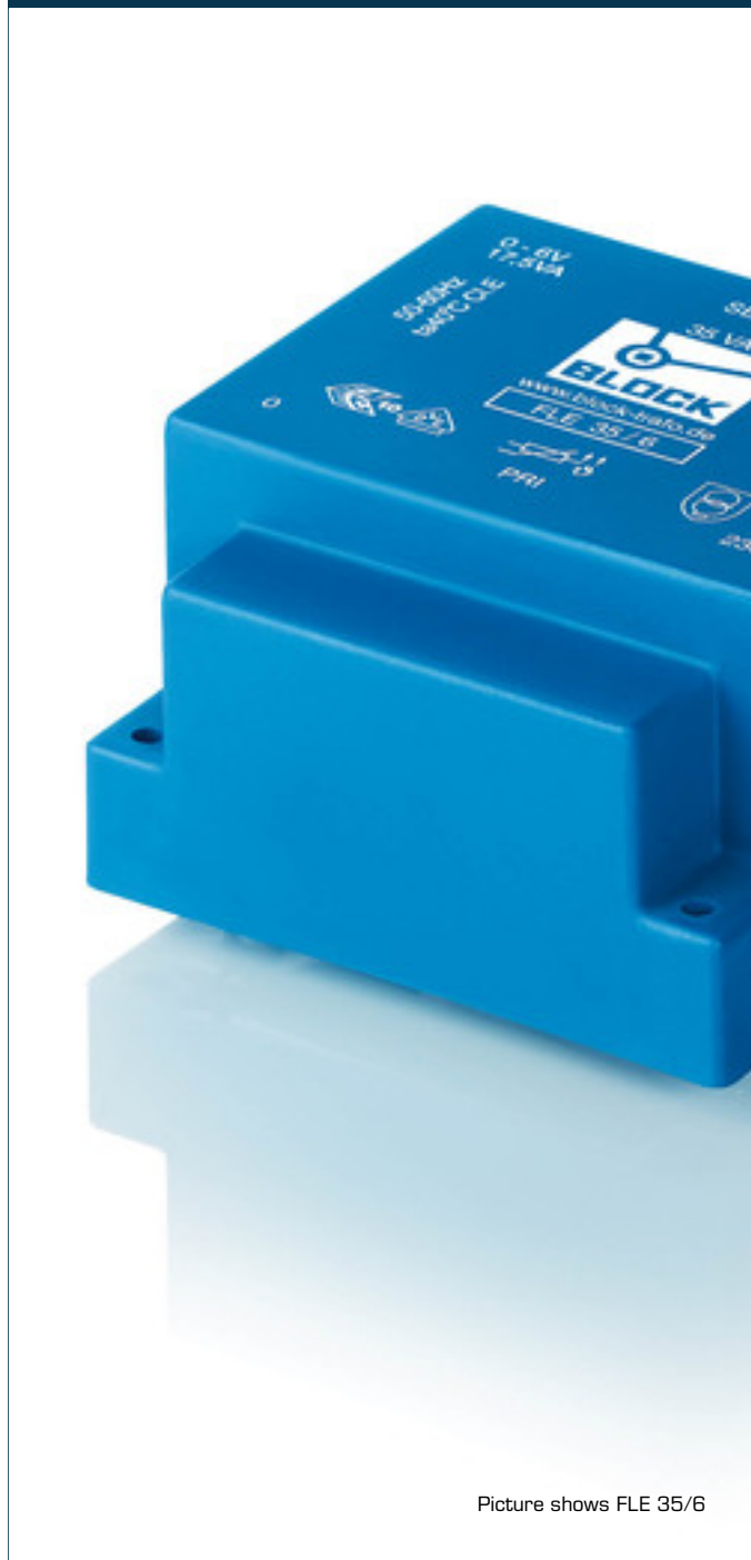
Picture shows FLE 35/6