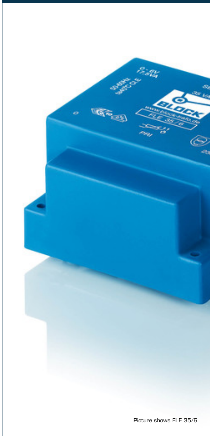
Picture shows FLE 35/6