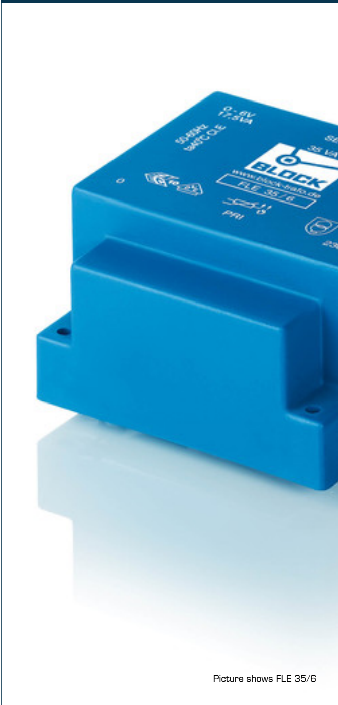
Picture shows FLE 35/6