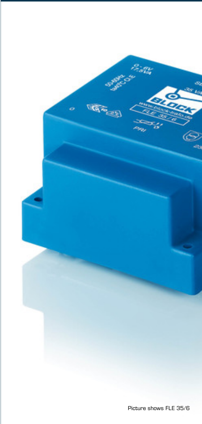
Picture shows FLE 35/6