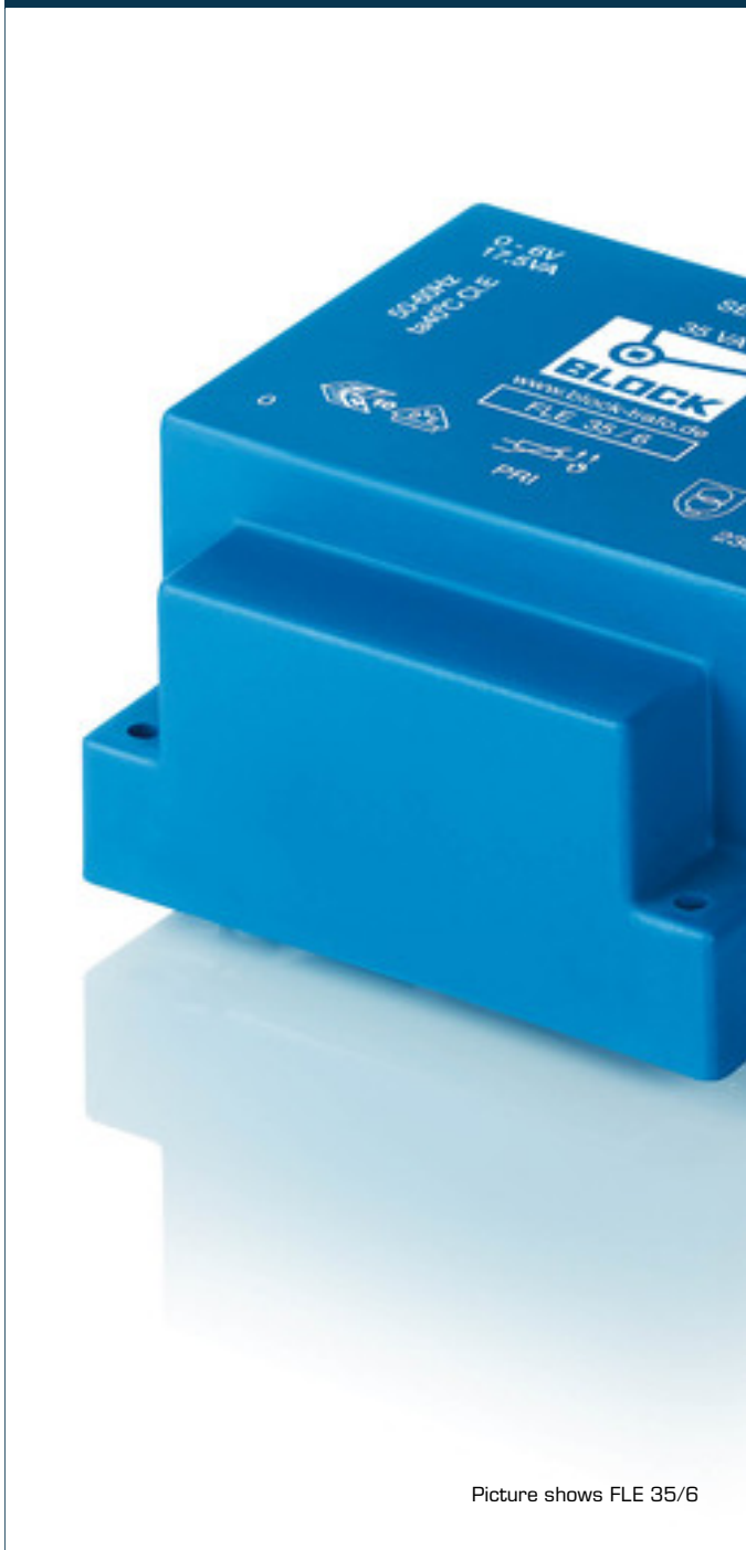
Picture shows FLE 35/6