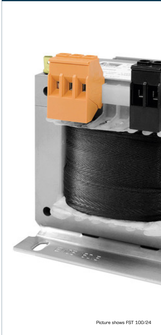
Picture shows FST 100/24