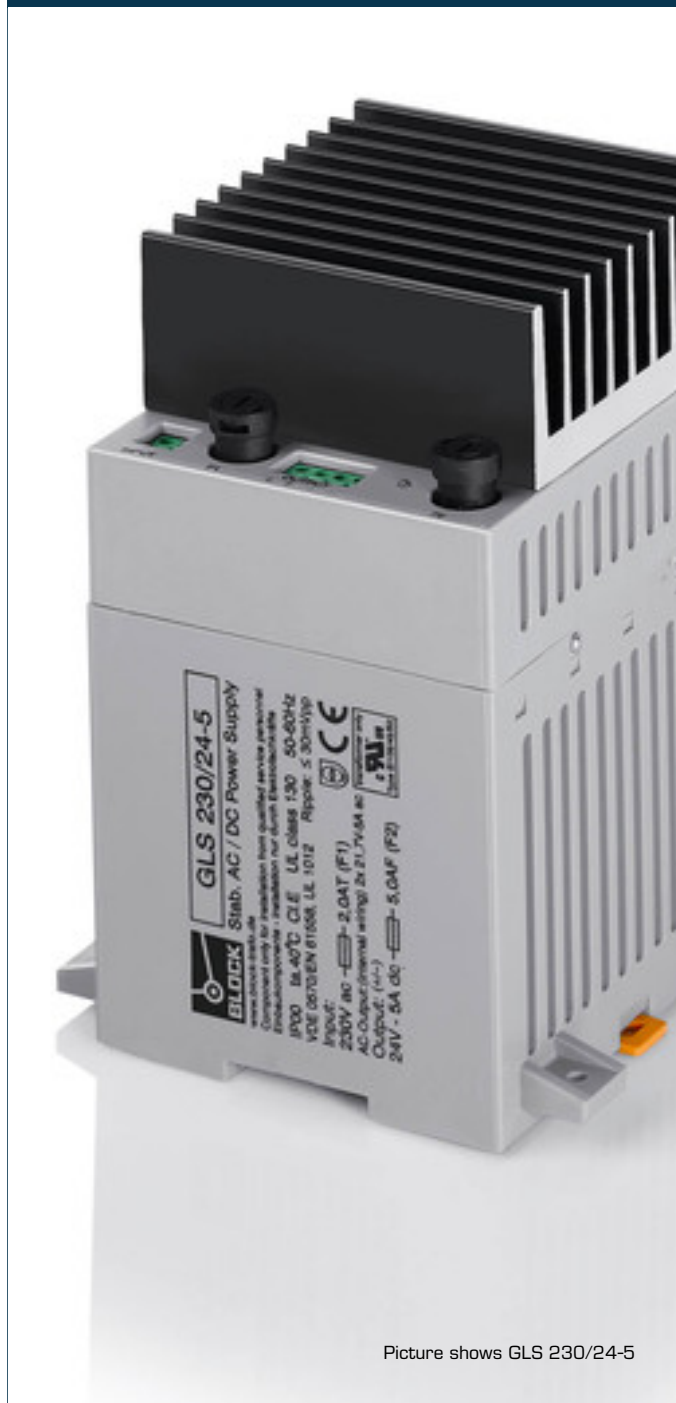
Picture shows GLS 230/24-5