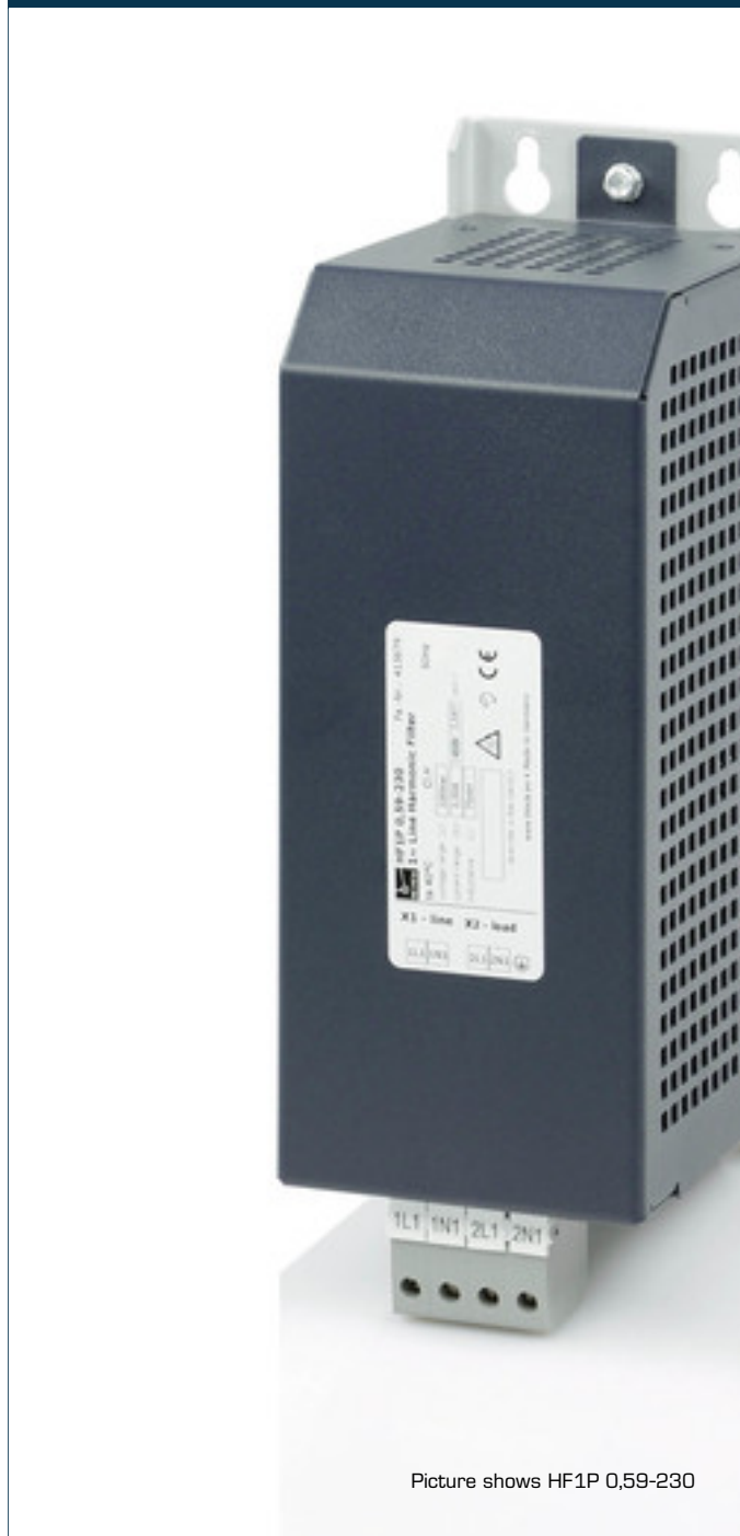
Picture shows HF1P 0,59-230