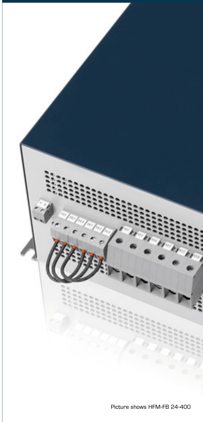
Picture shows HFM-FB 24-400