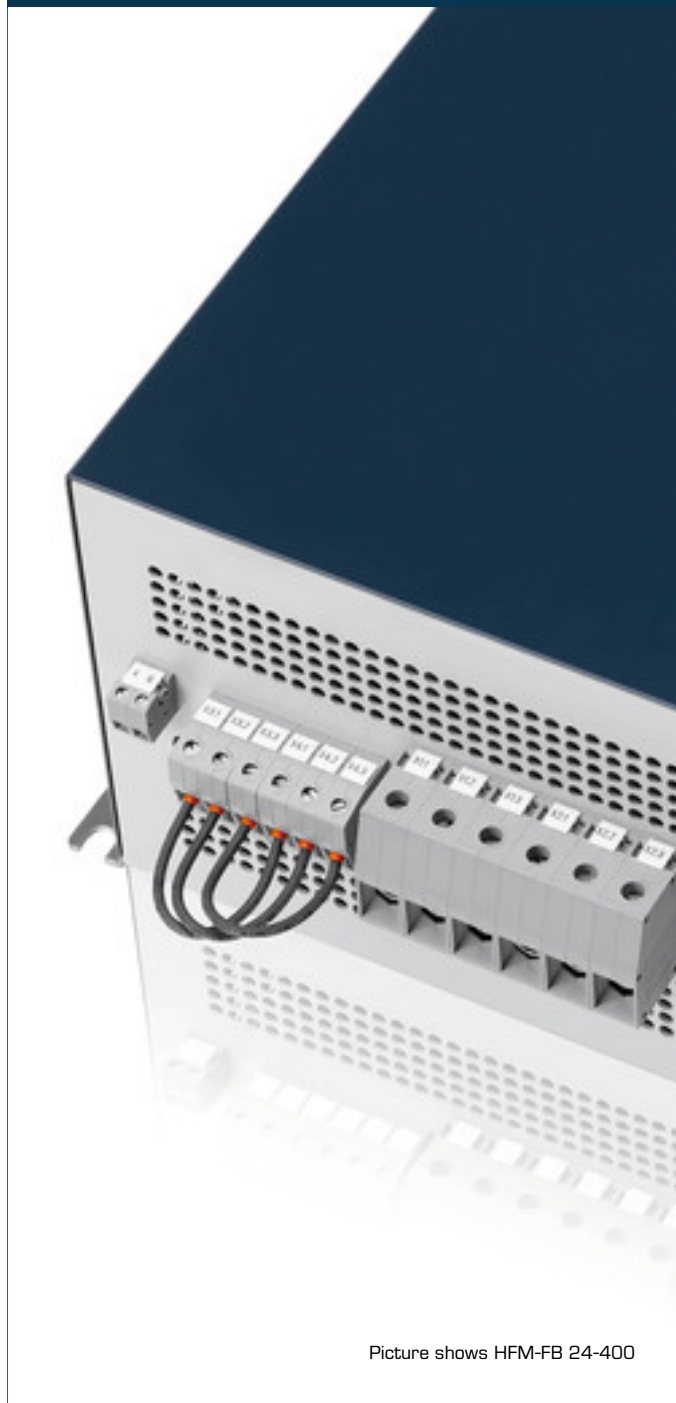
Picture shows HFM-FB 24-400