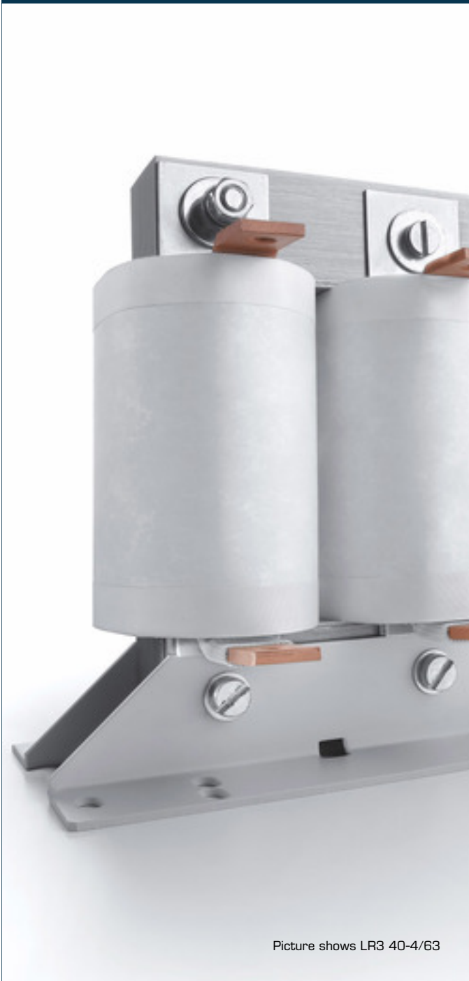
Picture shows LR3 40-4/63