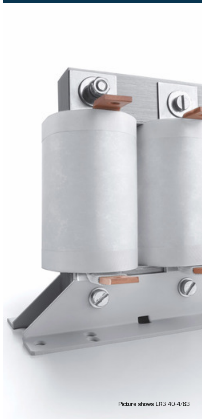
Picture shows LR3 40-4/63