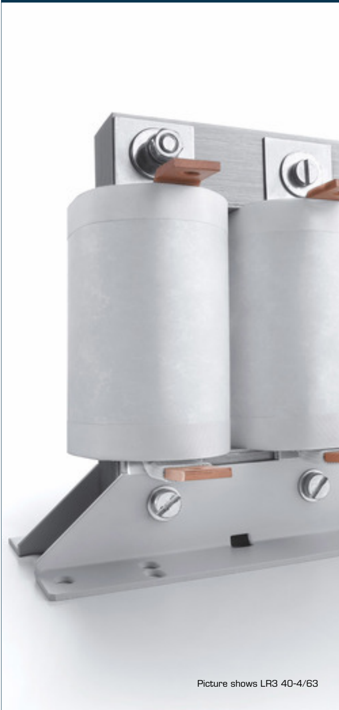
Picture shows LR3 40-4/63