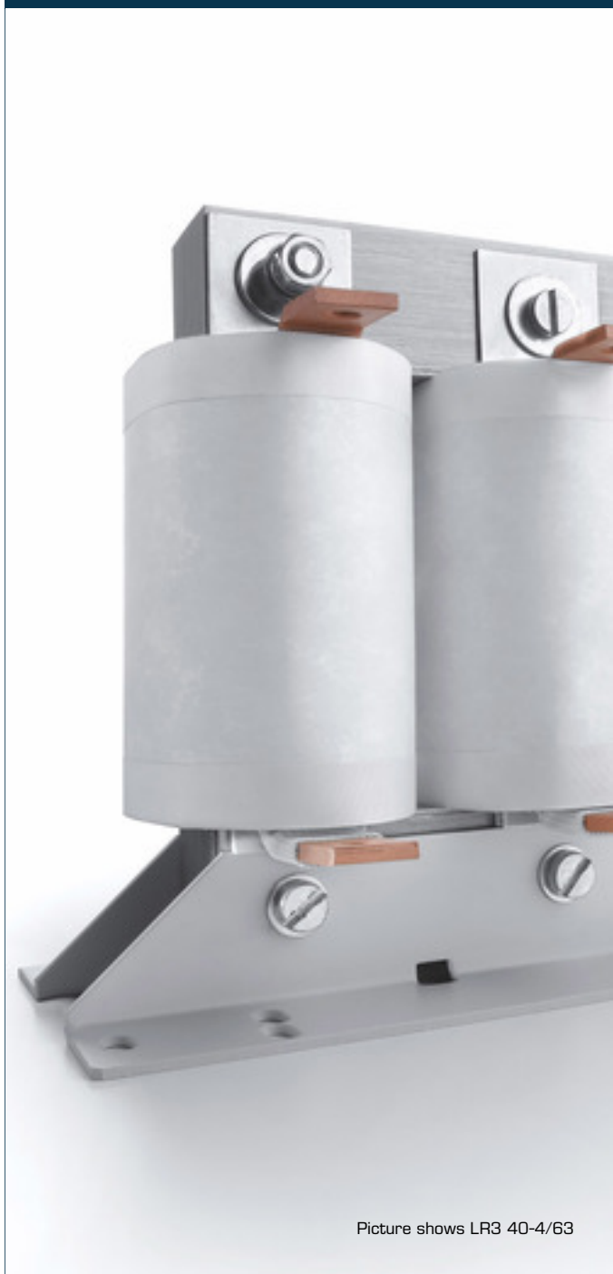
Picture shows LR3 40-4/63