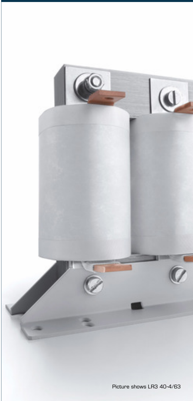
Picture shows LR3 40-4/63