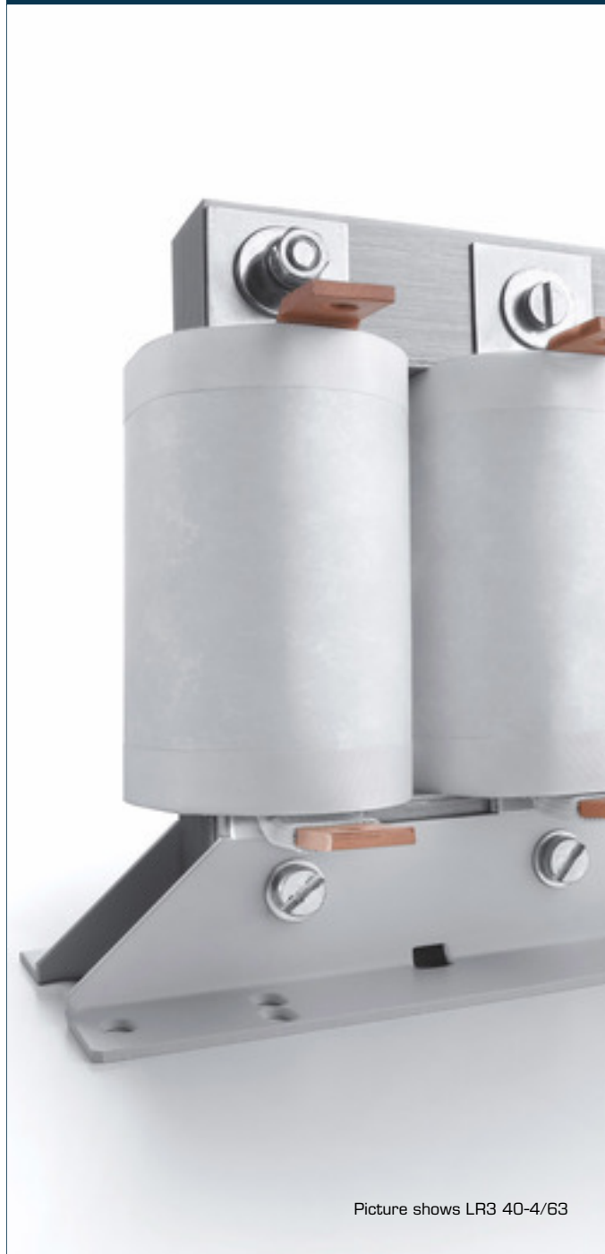
Picture shows LR3 40-4/63