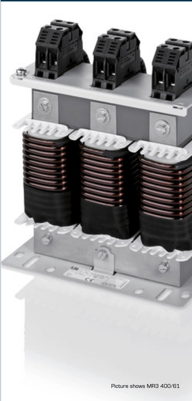
Picture shows MR3 400/61