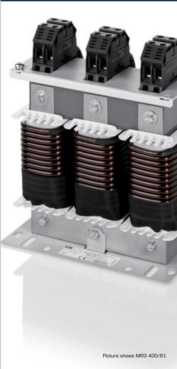
Picture shows MR3 400/61