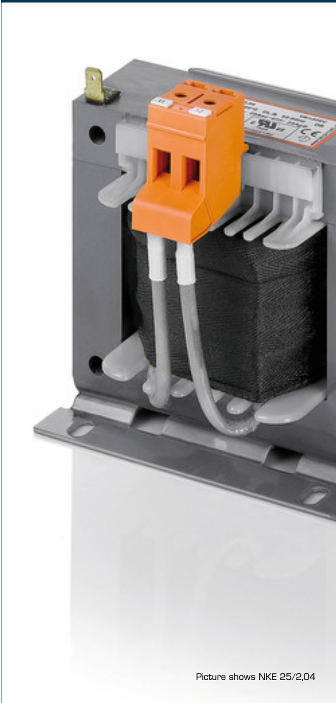
Picture shows NKE 25/2,04