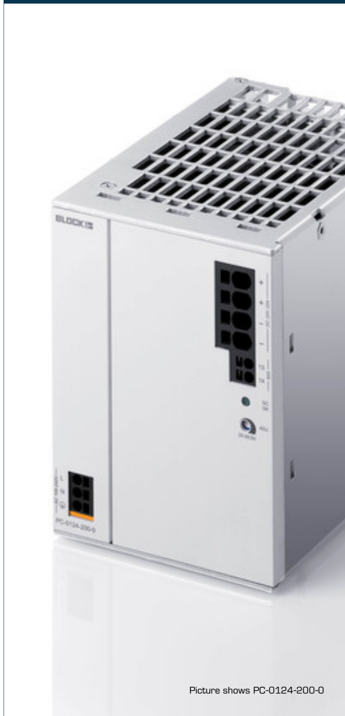
Picture shows PC-0124-200-0