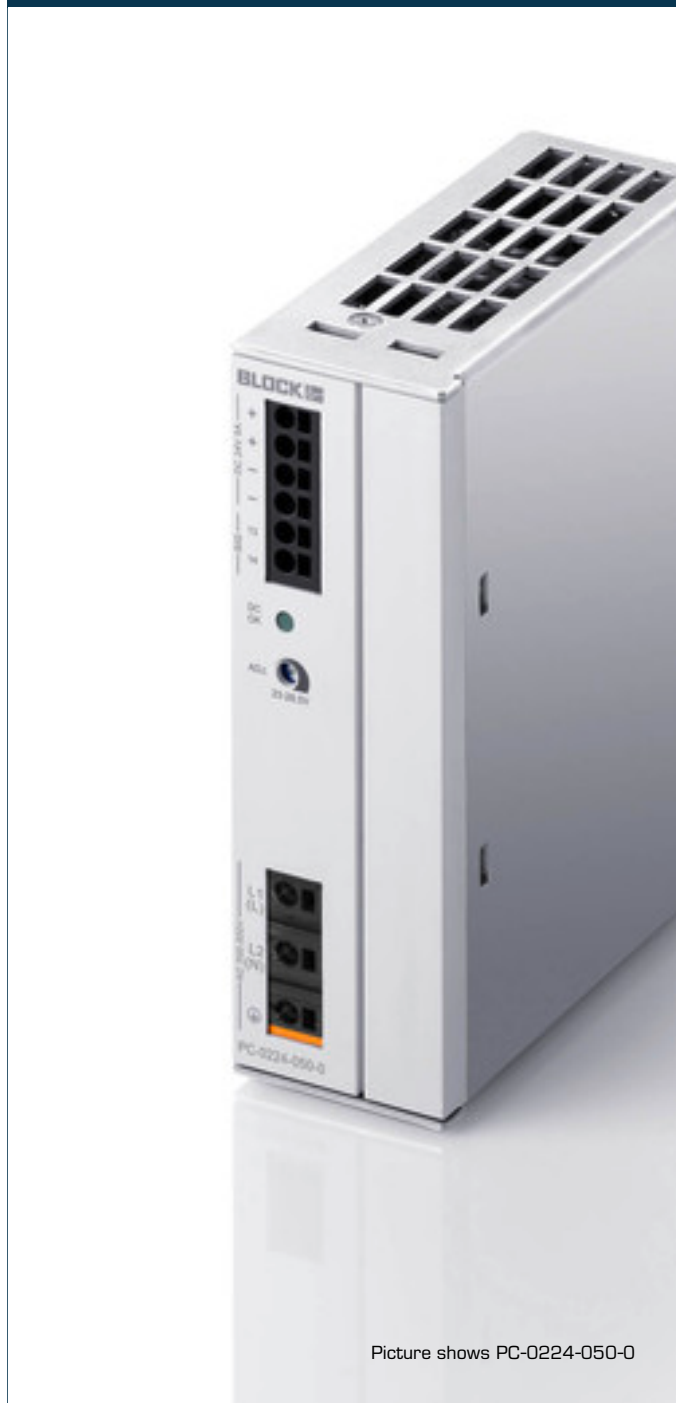
Picture shows PC-0224-050-0