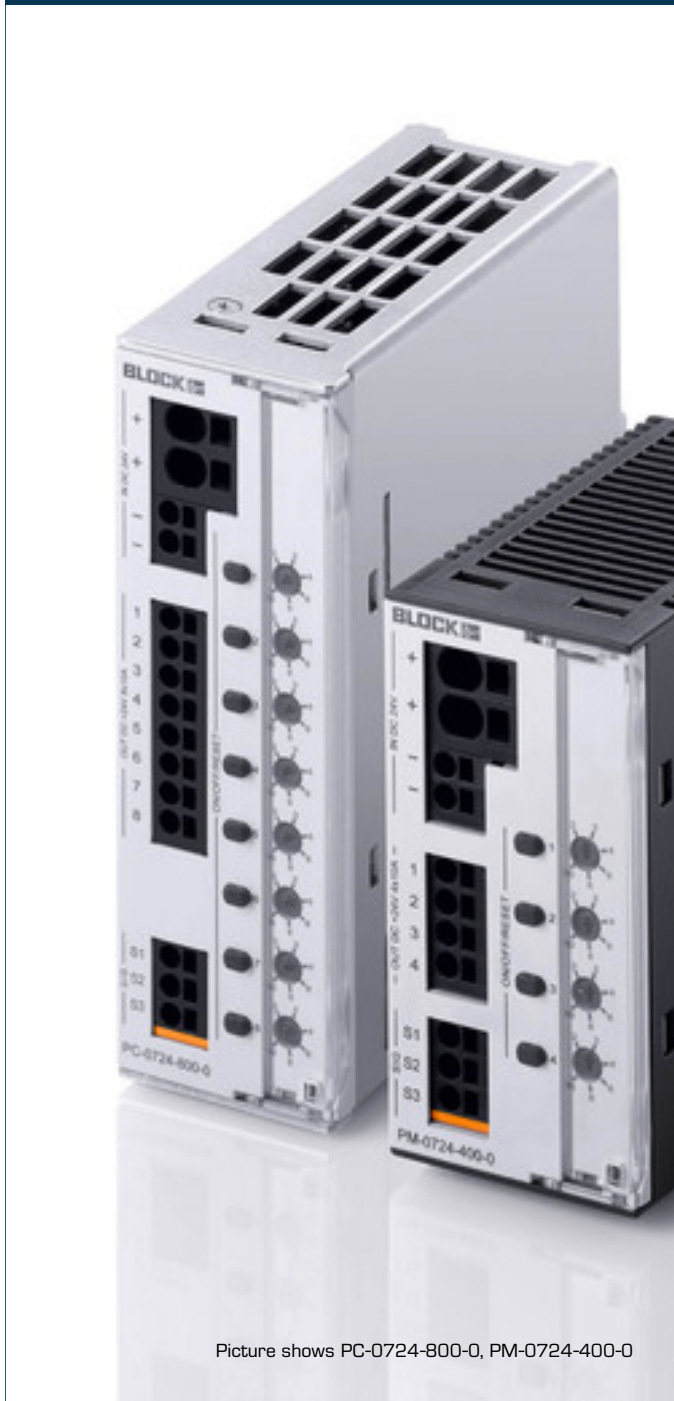
Picture shows PC-0724-800-0, PM-0724-400-0