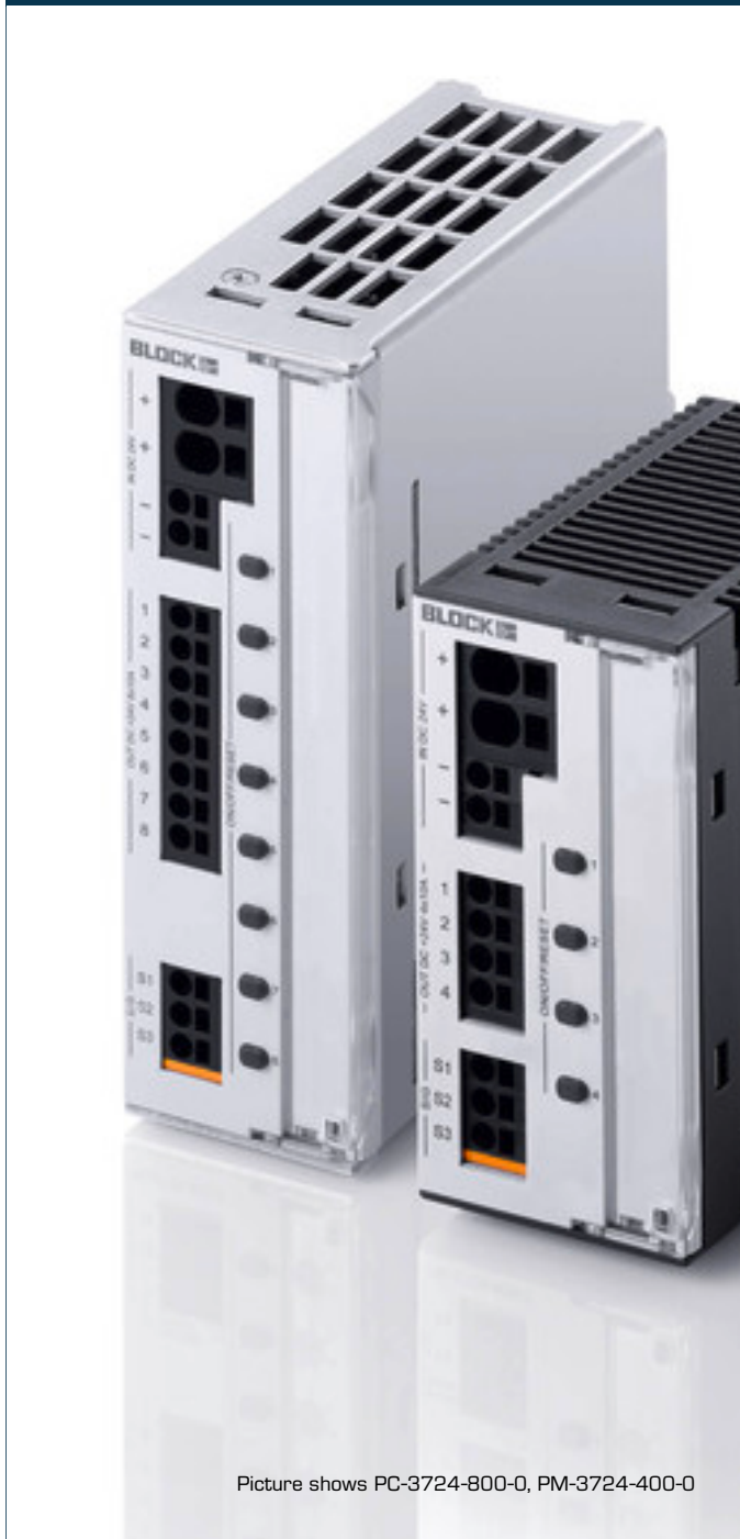
Picture shows PC-3724-800-0, PM-3724-400-0