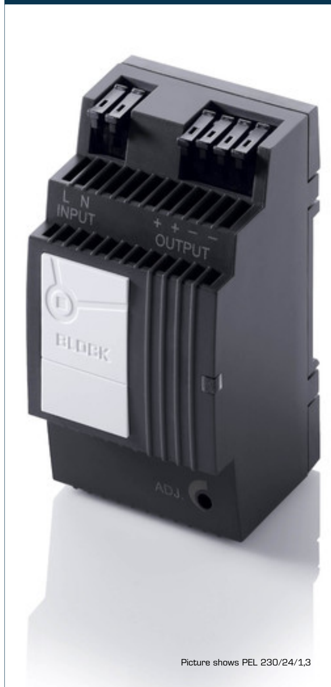
Picture shows PEL 230/24/1,3