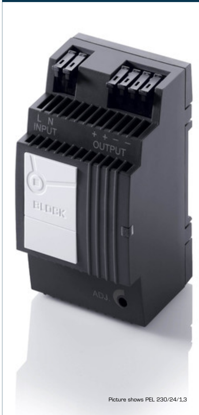
Picture shows PEL 230/24/1,3