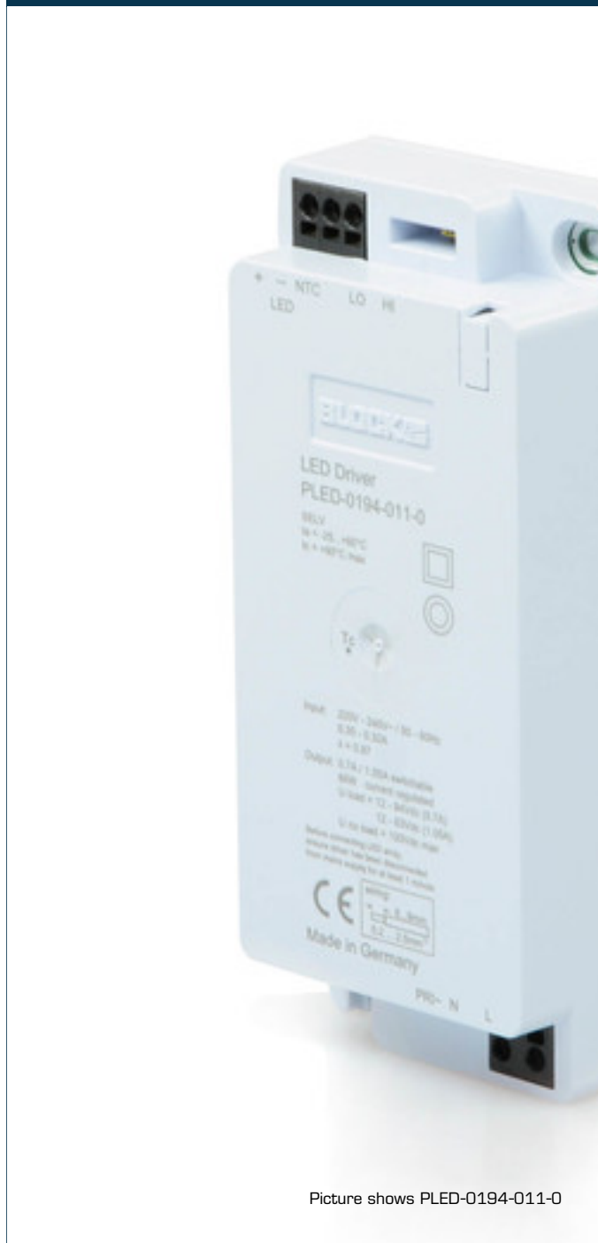
Picture shows PLED-0194-011-0