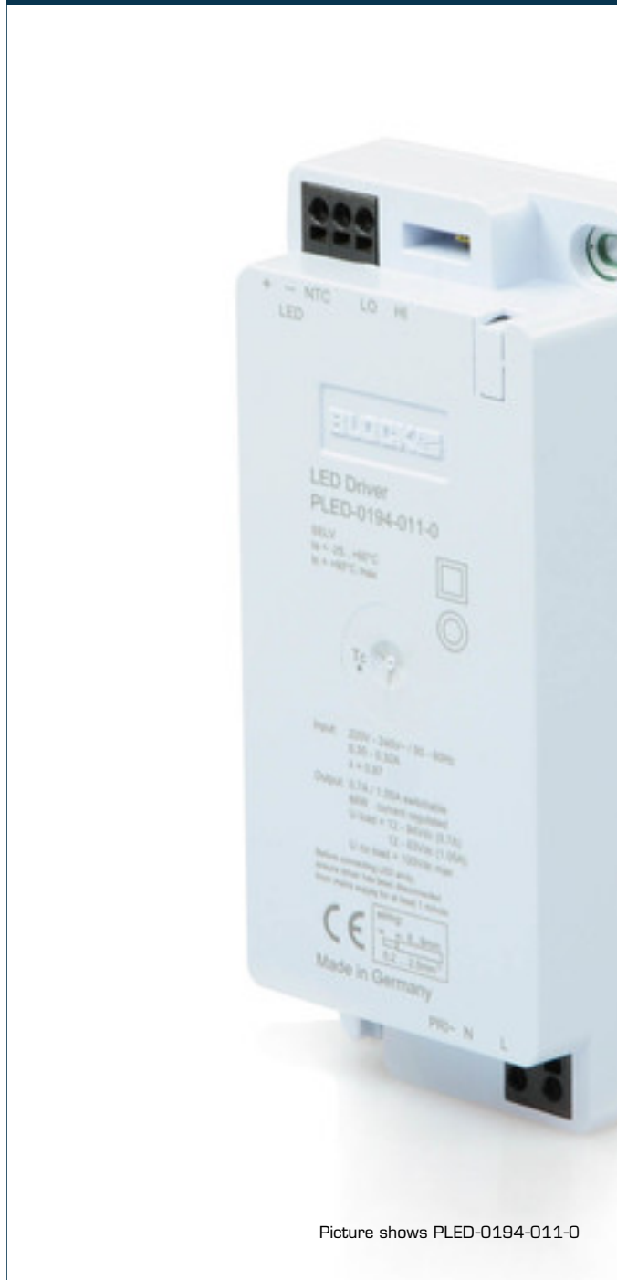
Picture shows PLED-0194-011-0