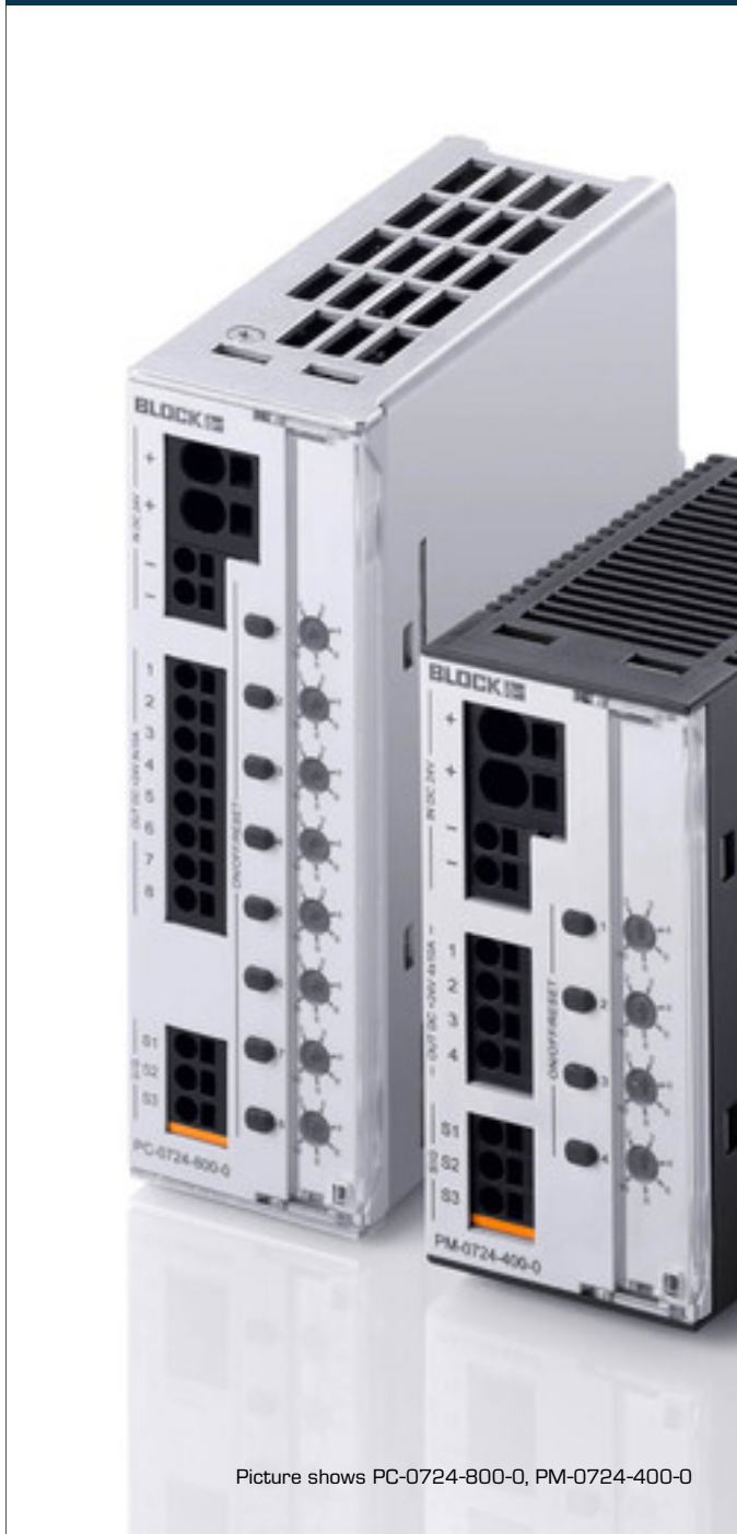
Picture shows PC-0724-800-0, PM-0724-400-0