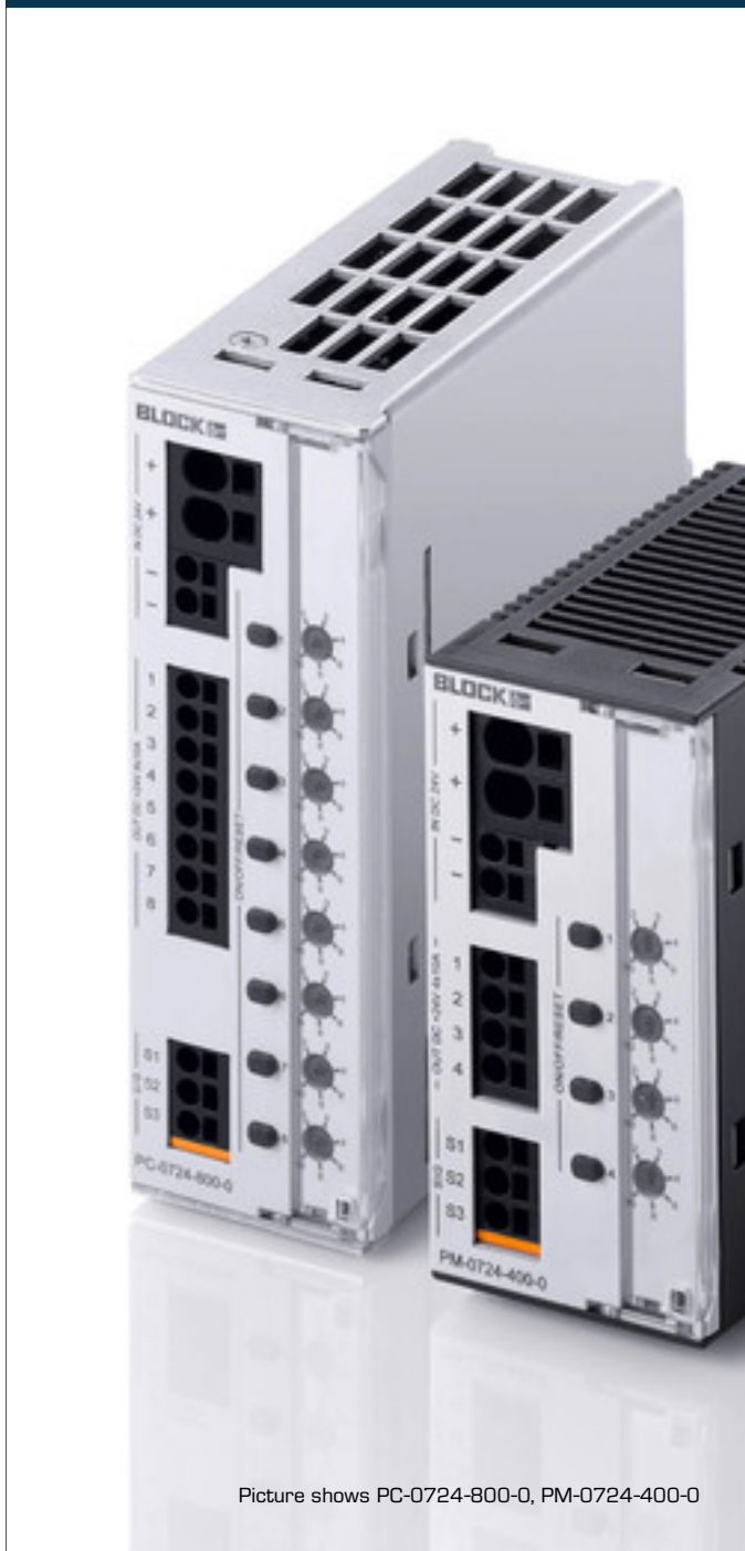
Picture shows PC-0724-800-0, PM-0724-400-0