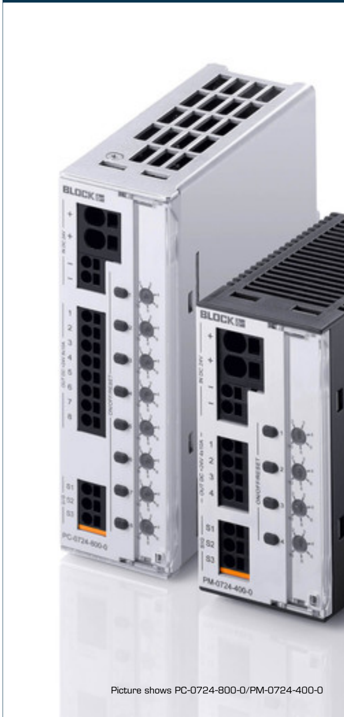
Picture shows PC-0724-800-0/PM-0724-400-0