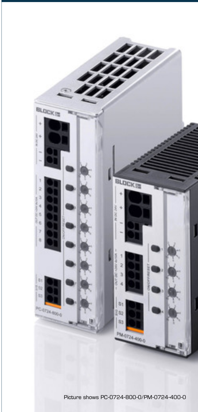
Picture shows PC-0724-800-0/PM-0724-400-0