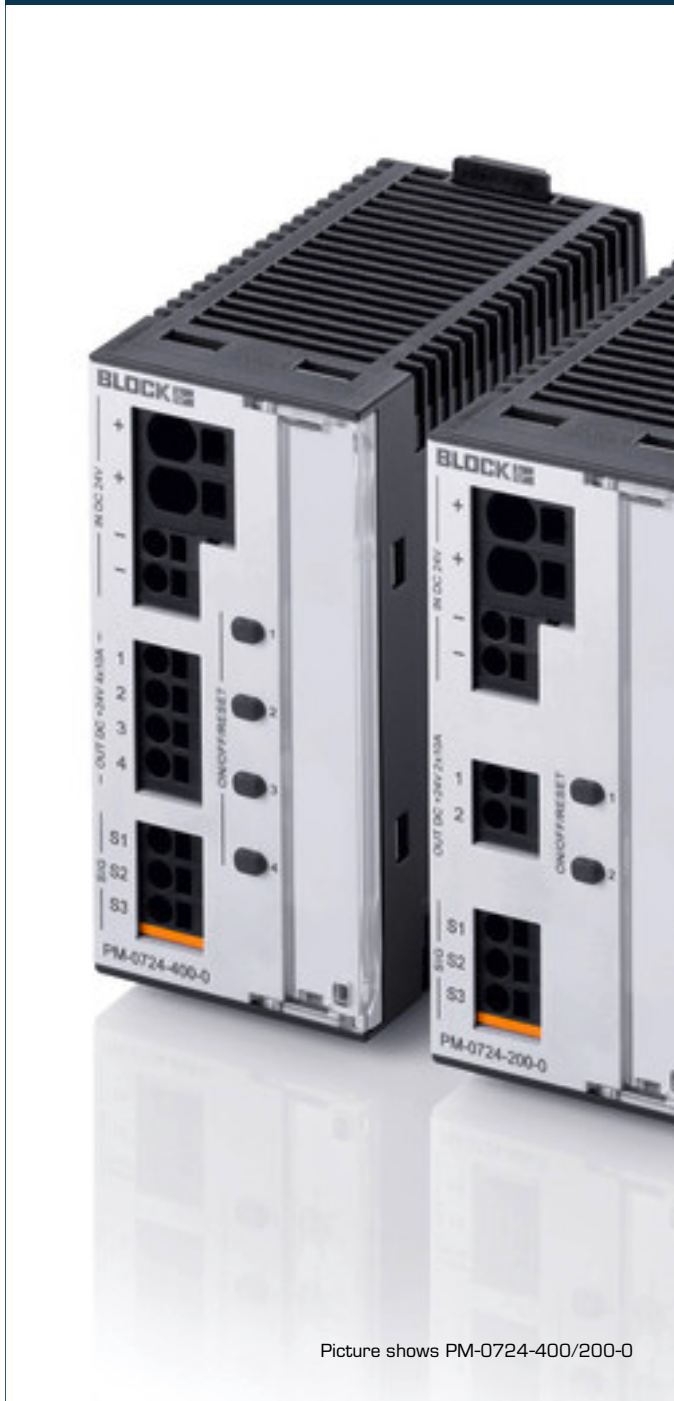
Picture shows PM-0724-400/200-0