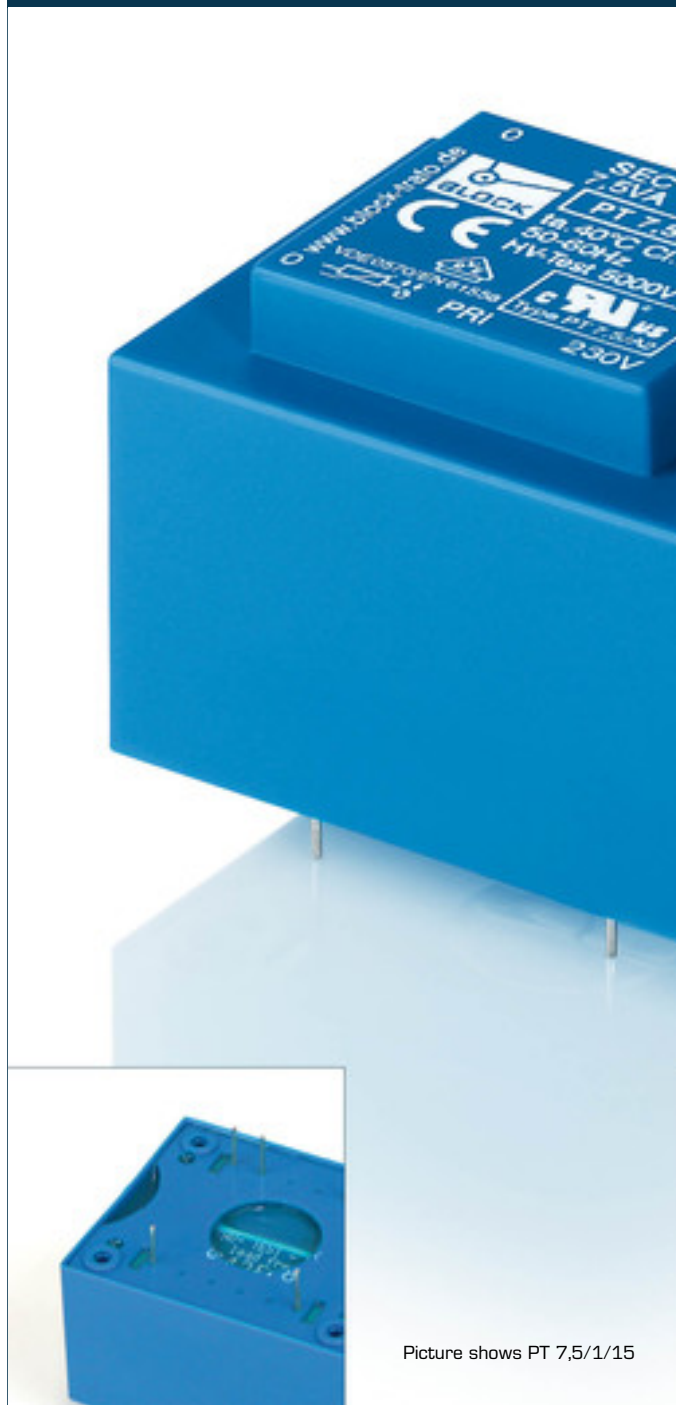
Picture shows PT 7,5/1/15