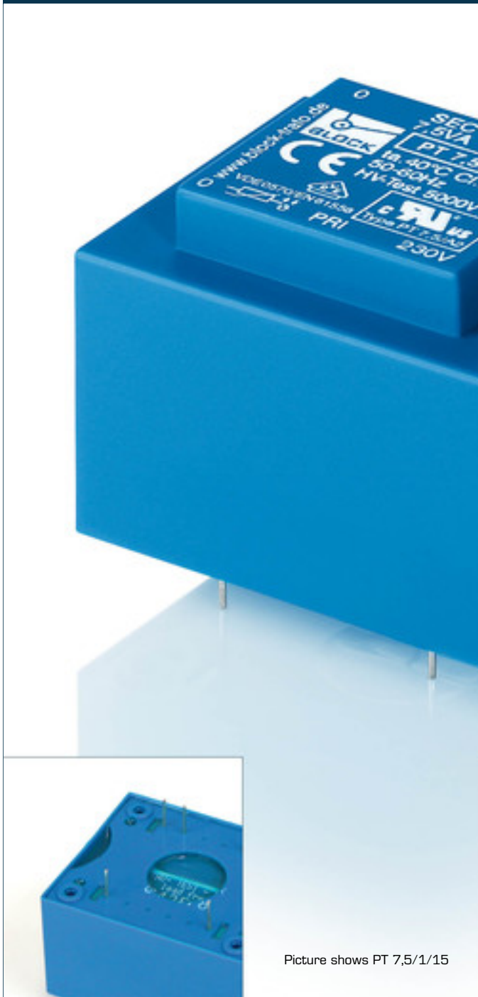
Picture shows PT 7,5/1/15