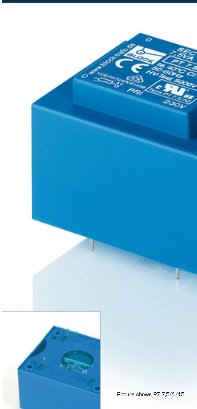
Picture shows PT 7,5/1/15