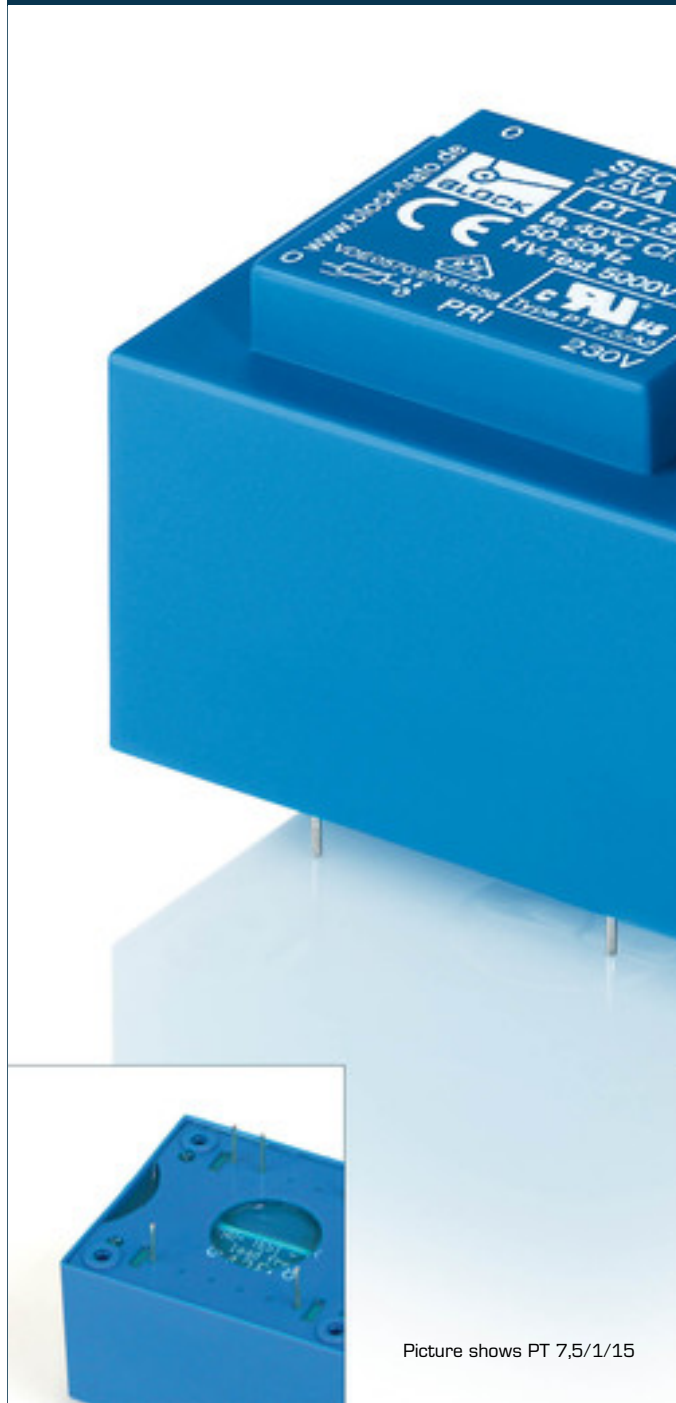
Picture shows PT 7,5/1/15