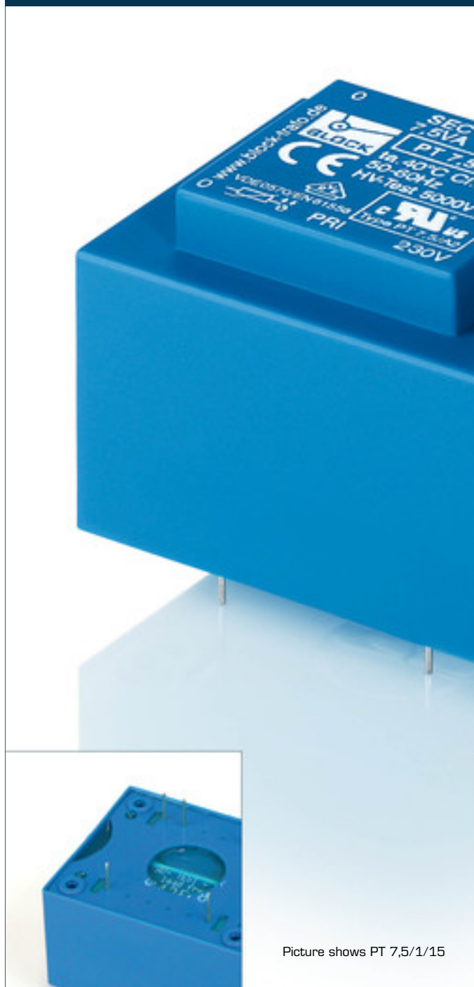
Picture shows PT 7,5/1/15