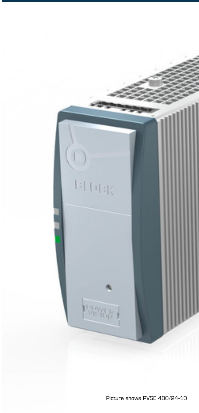
Picture shows PVSE 400/24-10