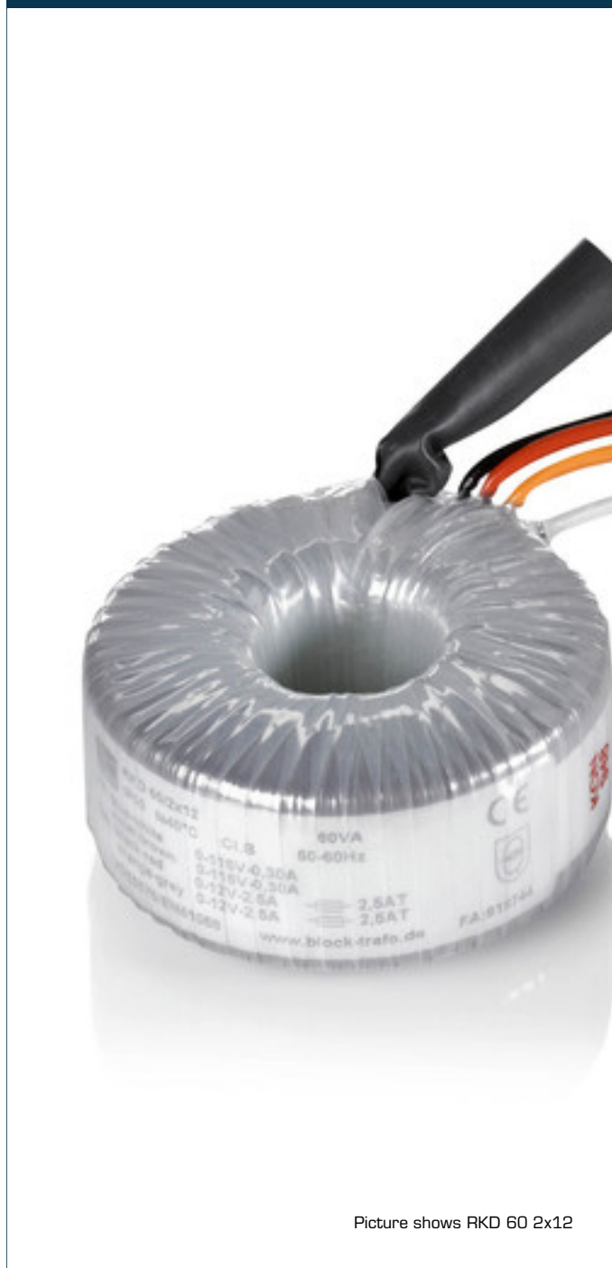
Picture shows RKD 60 2x12